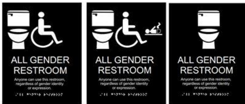
Figure 1 – Standard Signage

Use the standard signage shown in Figure 1 as applicable.